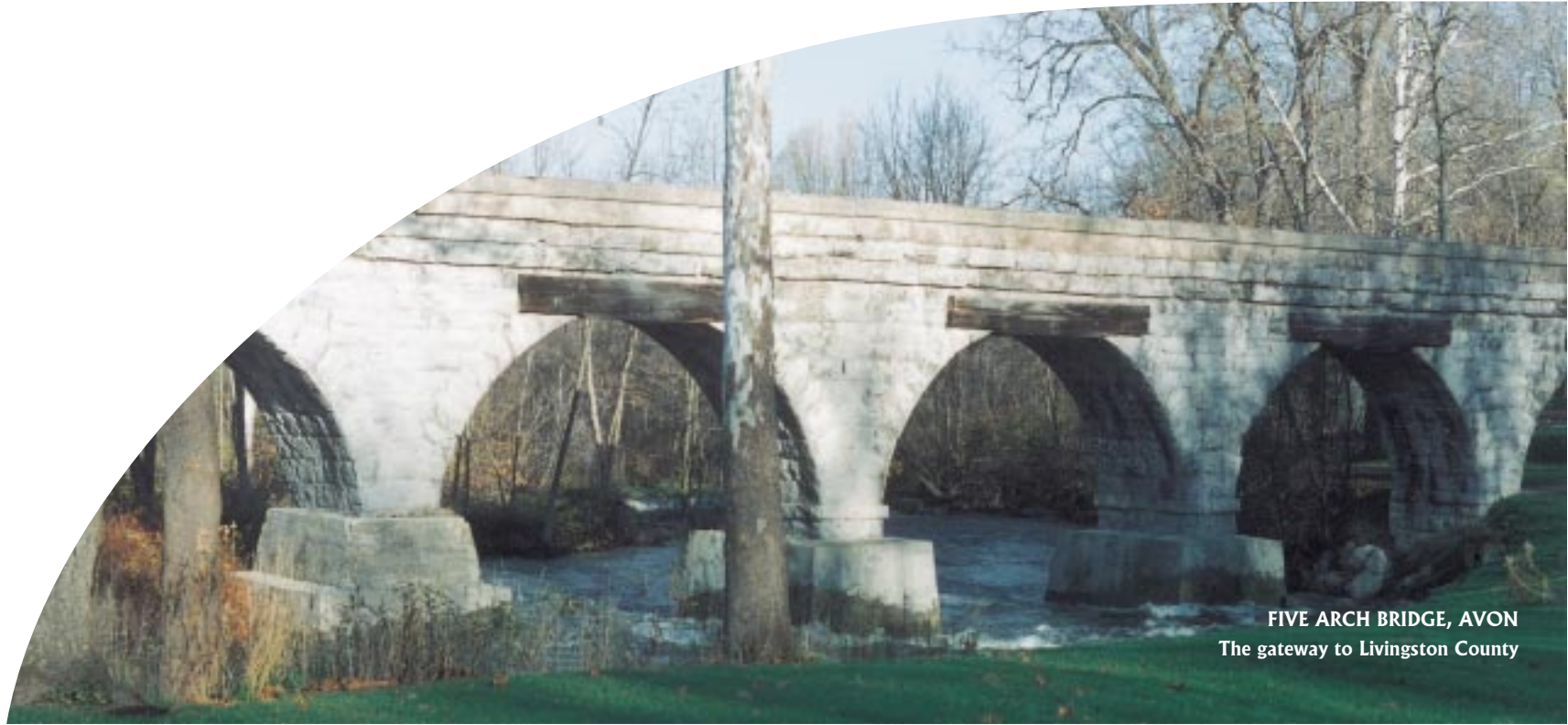
FIVE ARCH BRIDGE, AVON The gateway to Livingston County